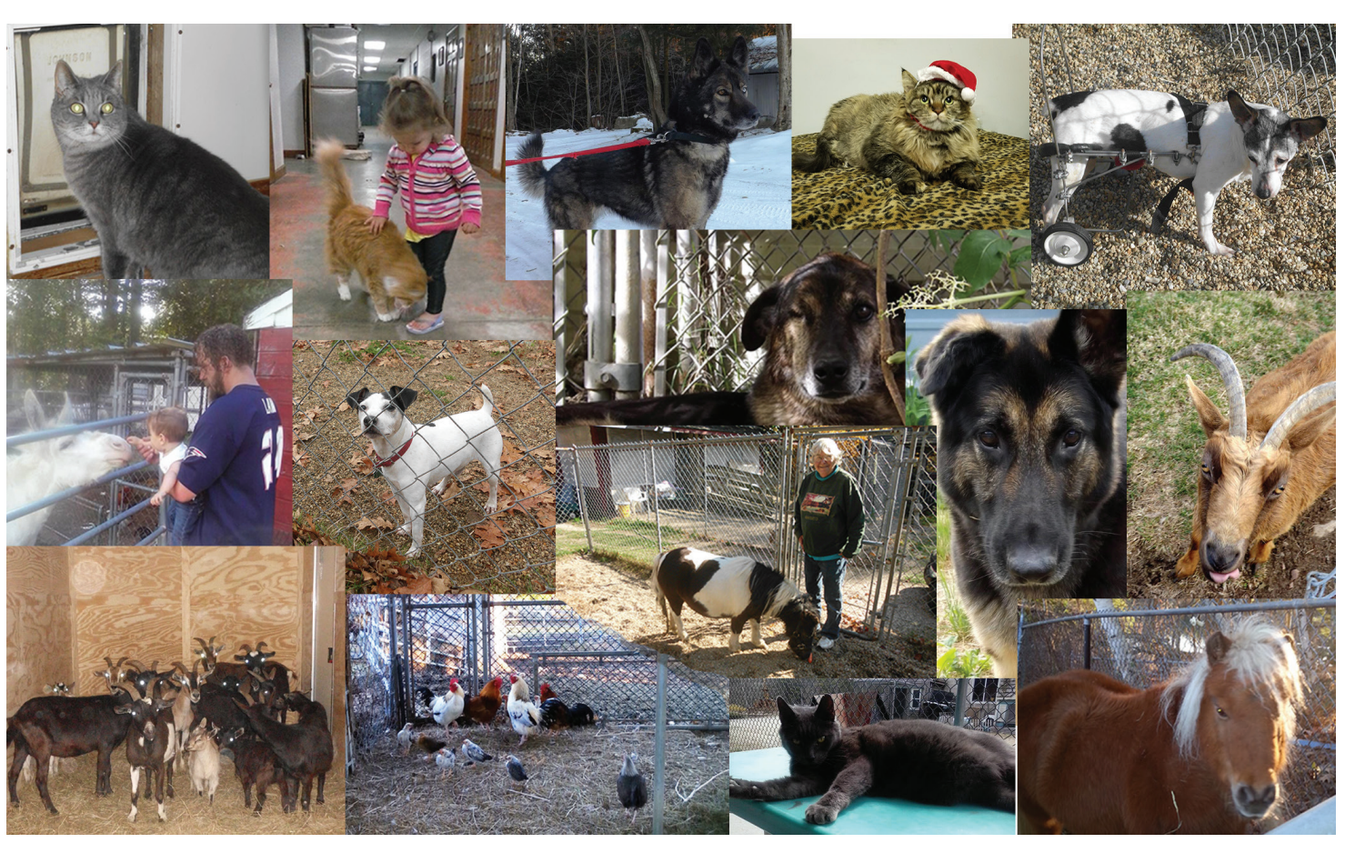
You Saved Us